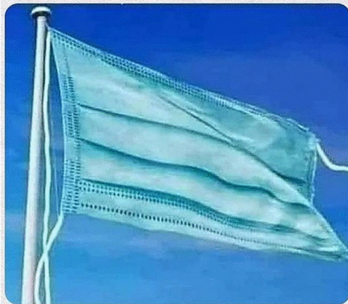
The Official flag of 2020

Though limited in scope, our enthusiasm remains high, and we all look forward to a more normal iteration of the Hospitality Committee.